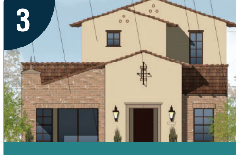
New Horizons by Morgan Hill Devco

Description: Mixture of 320 single-family units (46 affordable), located on Hill Road & Barrett Avenue.