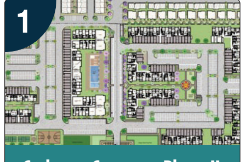
Cochrane Commons Phase II by Browman Development

Approved : The project has acquired all permits required to start construction.